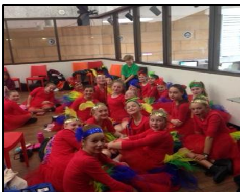
Waiting in the squishy holding room