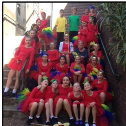
After the Matinee performance