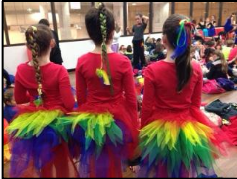
Costumes – Toucan tails