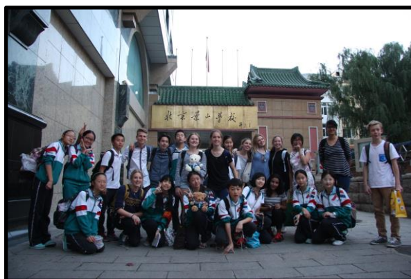
MHS students with their Jingshan buddies