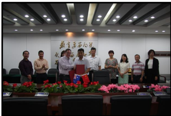
Signing of MOU