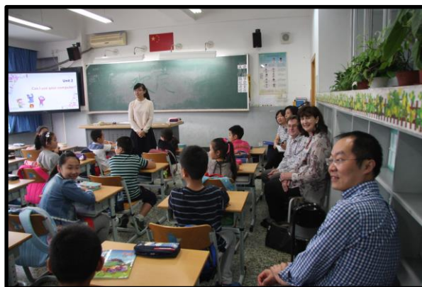
Observing a Year 4 English Lesson