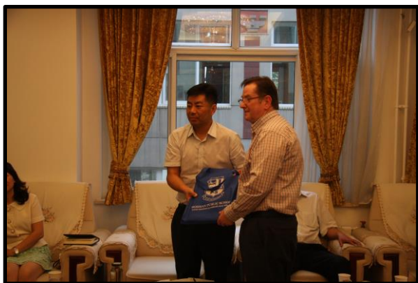
Cobcroft presenting a gift to Jingshan School

To view our blog of the trip, go to: http://beijing2088.edublogs.org/ Password: mos2015