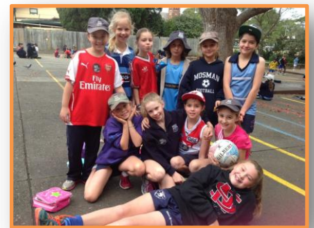
Year 4 students at lunchtime

We raised $714 Thank you for your generous donations.