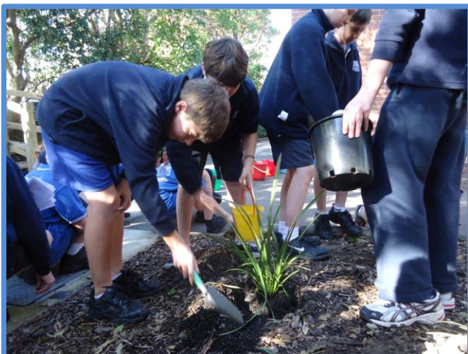
Planting on 'Schools Tree Day'