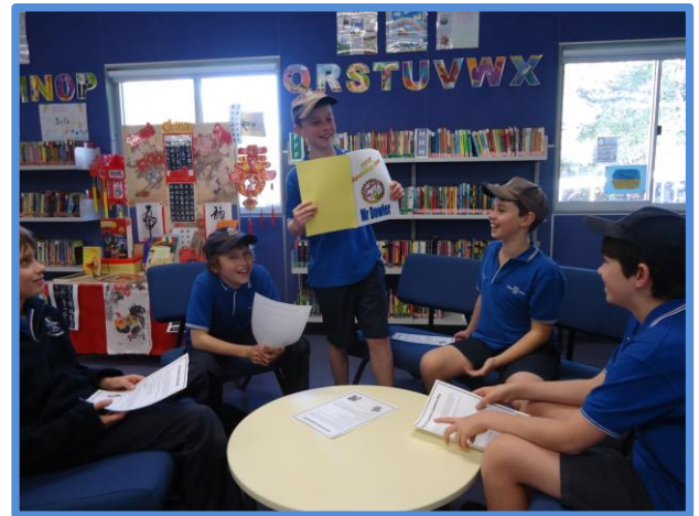
Spelling practice in the Library