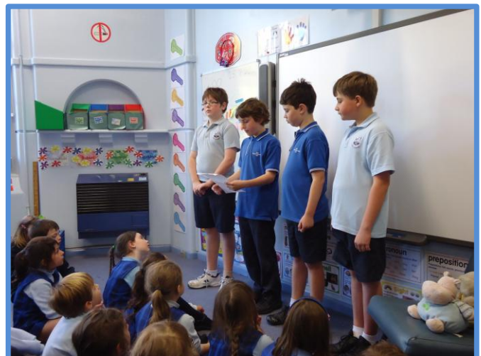
Year 6 presenting their speeches on National Tree Day