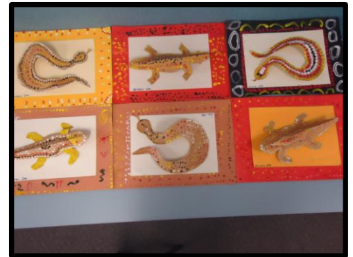
Year 2 created some Aboriginal inspired artworks for NAIDOC Week. They were displayed in Mosman Library.