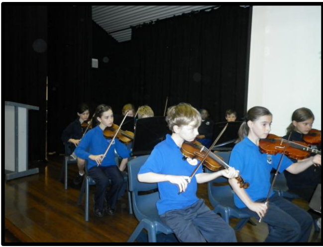
The Junior Strings were fantastic at Assembly